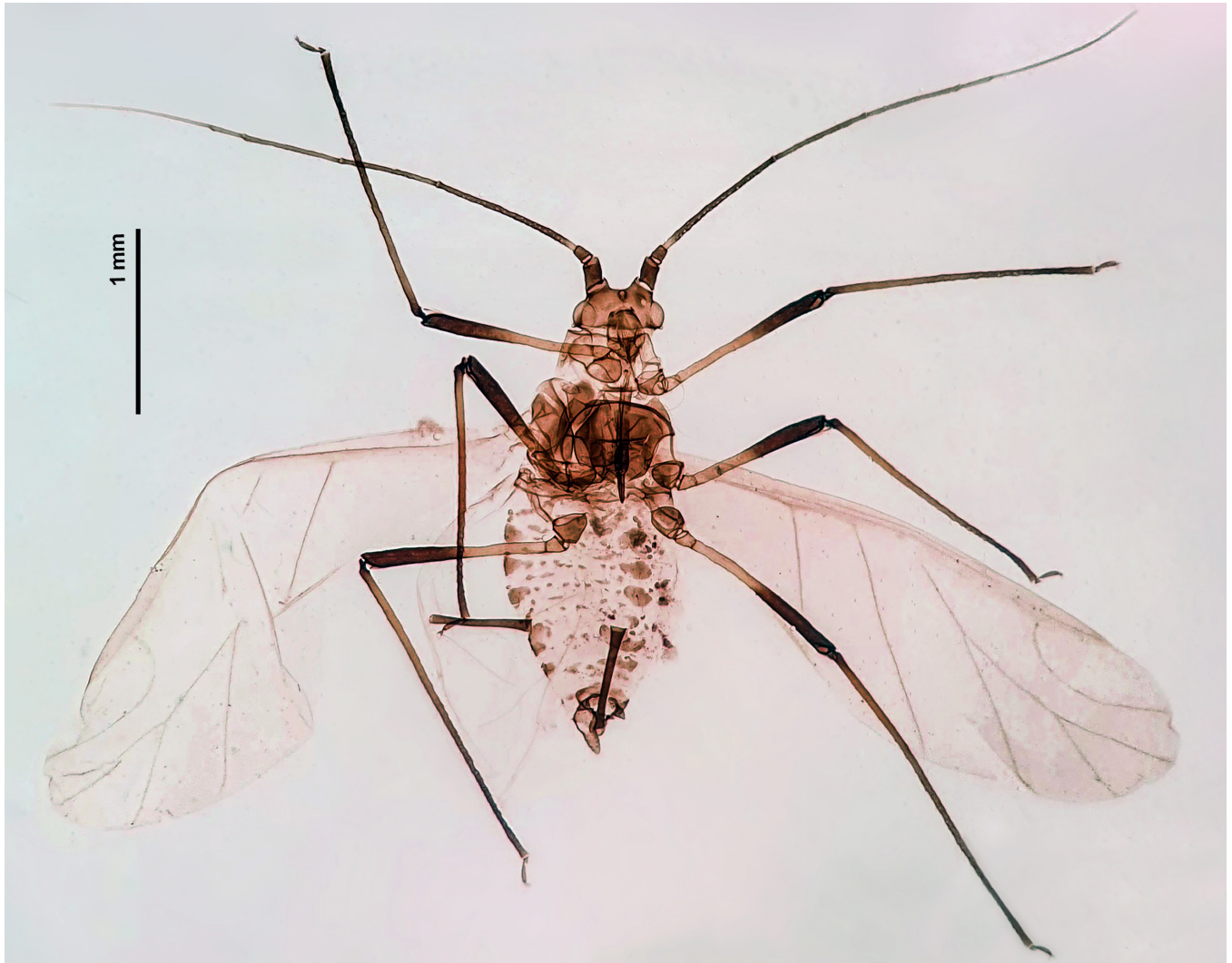
Figure 1. Habitus of Uroleucon carthami (Hille Ris Lambers, 1948), alate male.

First tarsal segment with 5:5:5 setae. HTII 0.10–0.13 mm, 0.14\text{--}0.16 \times \text{PT} and 0.62\text{--}0.72 \times \text{ANTVib} . Abdomen membranous, with oval marginal sclerites containing very small marginal tubercles and fine setae with pointed apices. ABDTVIII with (3)4–5 long setae. SIPH with ante- and post-siphuncular sclerites (Fig. 2F). SIPH 0.47–0.58 mm, tubular, slightly tapering, with subapical reticulation covering 15–21% of the distal length of SIPH (Fig. 2H). SIPH 2.18\text{--}2.70 \times \text{Cauda} , 0.20\text{--}0.25 \times \text{BL} , 0.67\text{--}0.76 \times \text{ANTIII} , 0.64\text{--}0.81 \times \text{PT} , 2.64\text{--}3.22 \times \text{URS} , 4.21\text{--}5.02 \times \text{HTII} and 0.94\text{--}1.13 \times \text{HW} . Cauda long-triangular, 0.17–0.24 mm long, 0.37\text{--}0.48 \times \text{HW} , 0.99\text{--}1.34 \times \text{URS} , 0.07\text{--}0.10 \times \text{BL} , with (15)17–22 fine long setae mostly on its apex. Parameres long triangular covered with fine, pointed setae. Basal part of phallus as long as or slightly longer than parameres (Fig. 2J).