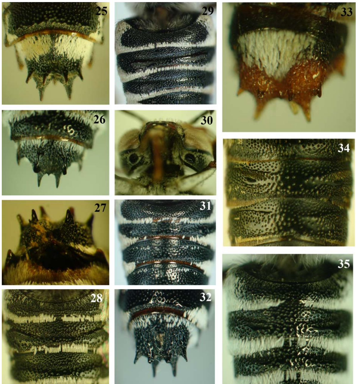
Figures 25-35. 25- Coelioxys acanthura : tergum VI, 26- Coelioxys quadridentata : tergum VI, 27-28- Coelioxys acanthura : 27- tergum VII, 28- tergum II, 29- Coelioxys brevis : tergum II, 30-32- Coelioxys afra : 30-genal fossa, 31- tergum II, 32- tergum VI, 33- Coelioxys haemorrhoea : tergum VI, 34- Coelioxys inermis : tergum II, 35- Coelioxys quadridentata : tergum II.