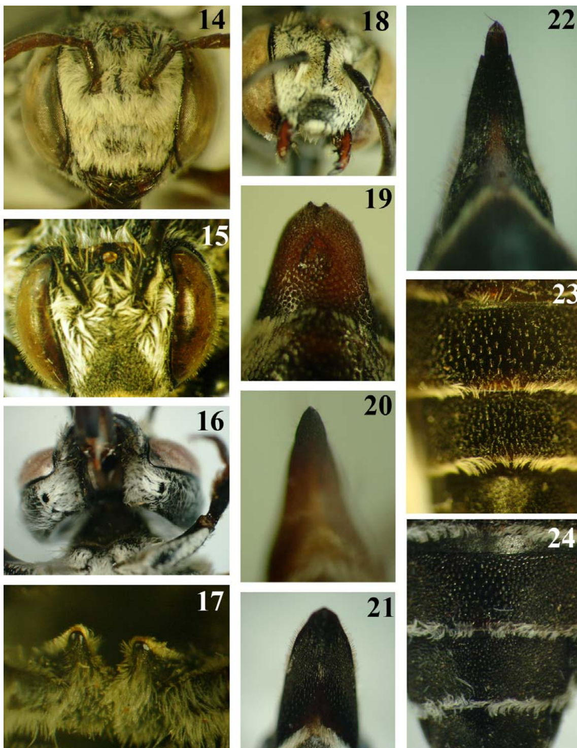
Figures 14-24. 14- Coelioxys decipiens : head in frontal view, 15- Coelioxys conoidea : head in frontal view, 16- Coelioxys emarginata : head in lower view, showing genal fossa and front coxa, 17- Coelioxys inermis : front coxa, 18-19- Coelioxys afra : 18- head in frontal view, 19- sternum VI, 20- Coelioxys semenowi : sternum VI, 21- Coelioxys conoidea : sternum VI, 22- Coelioxys inermis : sternum VI, 23- Coelioxys elongata : sternum III and IV, 24- Coelioxys inermis : sternum III and IV.