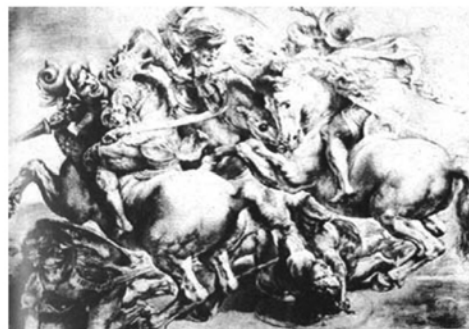
Figure 16A The Battle of Anghiari; The work originated in (august1504 -6); famous copy by P. P. Rubens-1605 A.D. (Paris, Louvre).

The same interest in war instruments, techniques, tactics and scenes could be found in Leonardo's works. Leonardo draws a painting from " The Battle of Anghiari " (1490/ 900 A.H.) (Figure 16A), of which there is no trace and only a reference could be made by Rubens' note of this work. Leonardo was known as a war painter. He was a military engineer and several drawings of war tools and instruments are left from him. (Figure 16B), Accordingly, Behzad, in " Zafar-Nameh " and other works such as " Bahram's Fight with Dragon " and " Battle of Leili and Majnun's Tribes ", has paid much insight to real and imaginary war instruments while demonstrating war scenes.