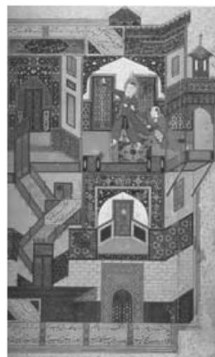
Figure 1 The seduction of Yusuf by Zulaykha’ Signed by Bihzad, from a Bustan of Sa’di, 1488; A. D. 30 x 21cm. General Egyptian Book Organization, Cairo, Adab Farsi 908.(E.Bahari)

given in this respect but is beyond the discussion of this article.