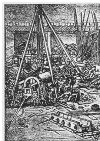
Figure 16B Project for the casting of a gigantic cannon (Windsor, Royal Library ).