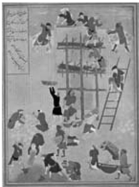
Figure 9 The Construction of the Palace Khovarnaq by Bihzad, from Khamsah of Nizami, 1494 A.D.; 20 x 14cm. BL, Or 6810. By Permission of the British Library (E. Bahari).