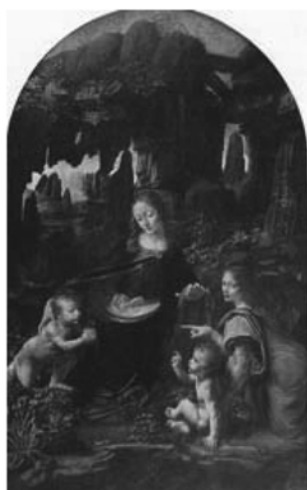
Figure 12 Leonardo Da Vinci, Vivgin of the Rocks, 1485 A.D. Oil on Wood (Transferred to Convas) Louvre, Paris. (Gardner)

distance between the ordinary people and sacred characters which has been gradually removed in the Renaissance paintings, and the fondling presence of light intensifies the emotion and feeling besides relief and perspective, making the relationship among the figures more natural.