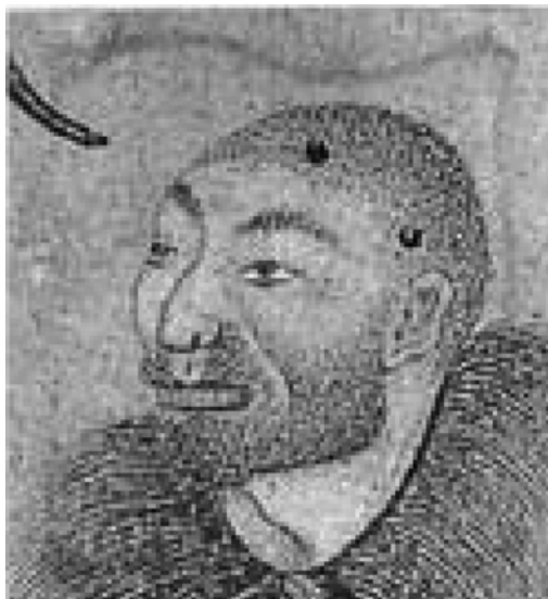
Figure 4 Behzad's drawing (expressionism in portraiture) Detile of Fig. 7.