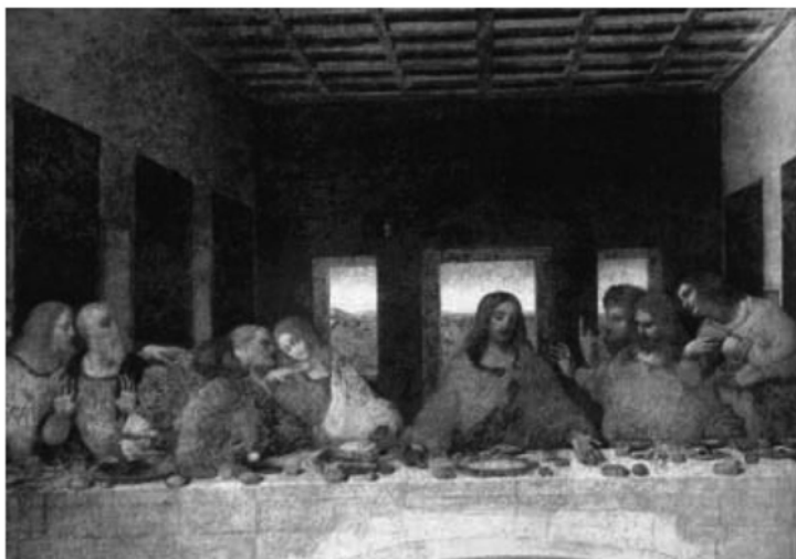
Figure 2 Leonardo Da Vinci: The Last Supper.

“Restoring the glory of Renaissance Frescoes, the painting is both formally and emotionally his most impressive work 9 .”