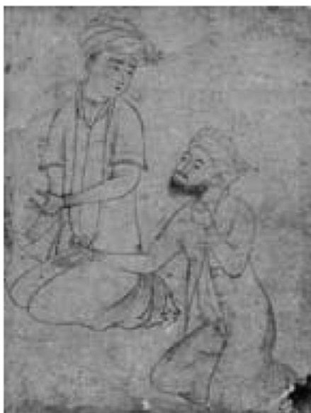
Figure 10 A part of Behzad's drawing (relationship among the figures).