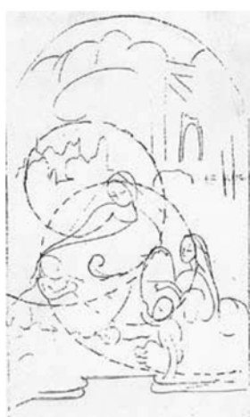
Figure 17 Spiral infrastructure in da Vinci's work [Virgin of the Rocks].

compositions conformed on spiral have been used. The lines of compositions are graphically displayed in conformity with the aforementioned works. One of the main factors, which have given life, dynamism and movement to the works of Behzad and da Vinci, are the use of such methods and styles for creating a relationship between the architectural spaces and figures, gestures and movements. Conforming infrastructure of compositions on the spiral are among the common features in Behzad and da Vinci's works, which turn the audience's eyes from outside into inside and all across the works.