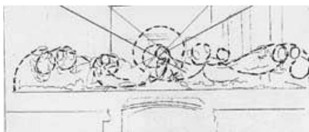
Figure 18 Spiral infrastructure in da Vinci's work [The Last Supper]