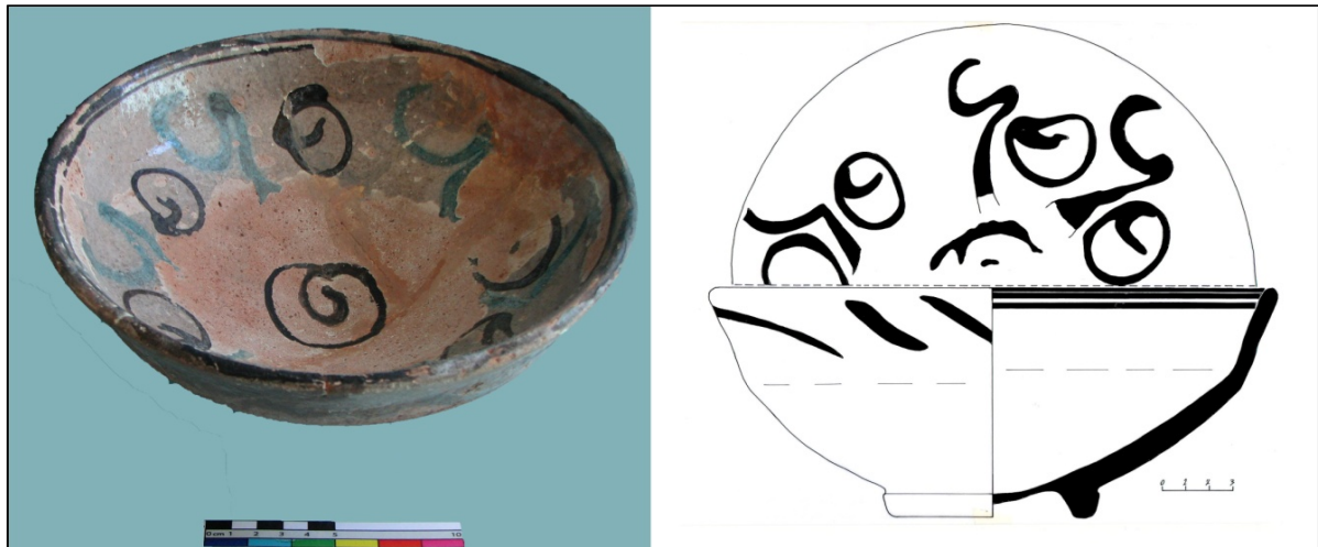
Figure 9. Typical Pottery of IIIB Group of Sultān Abād (b), Discovered at Zolf Abād of Farahan.