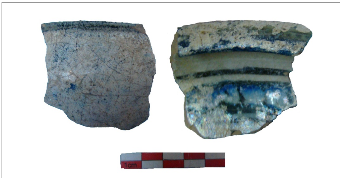
Figure 10. Sample Sultān Abād Pottery, Discovered at Tehran Plain.