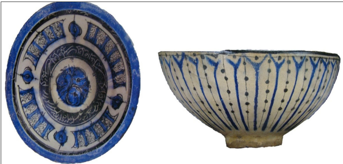
Figure 4. Style IIIA Pottery of Sultān Abād (also known as Kāshān Style).