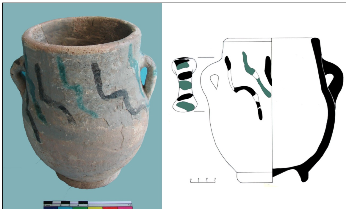
Figure 8. Typical IIIB Pottery of Sultān Abād, Discovered at Zolf Abād in Farahan.