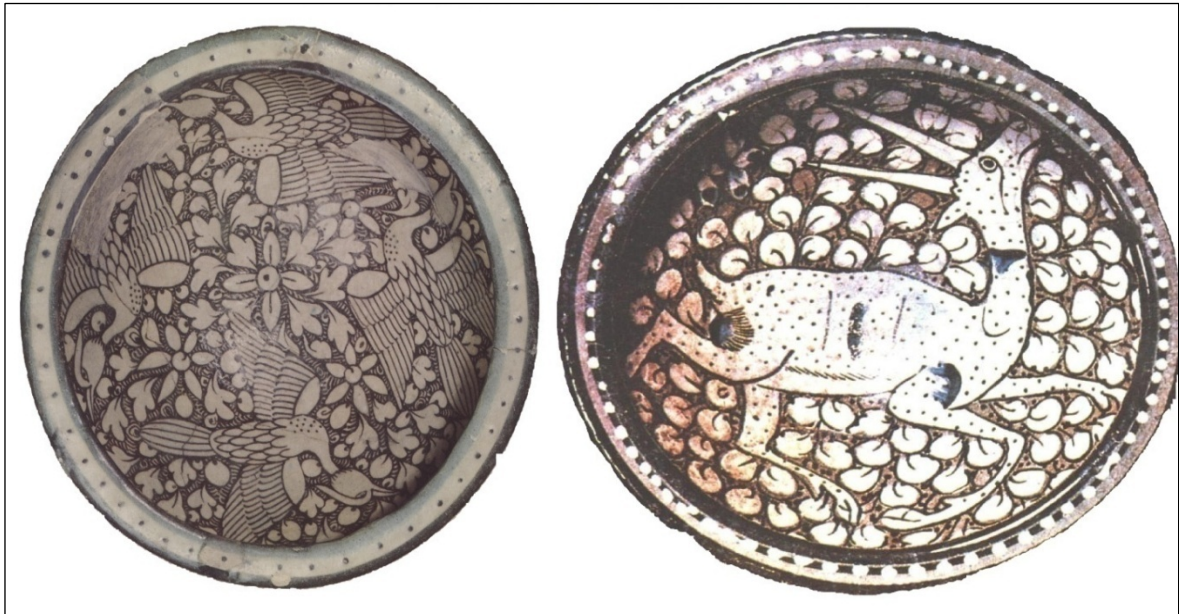
Figure 3. Style II Pottery of Sultān Abād.