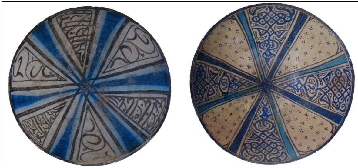
Figure 5. IIIB Style Pottery of Sultān Abād.