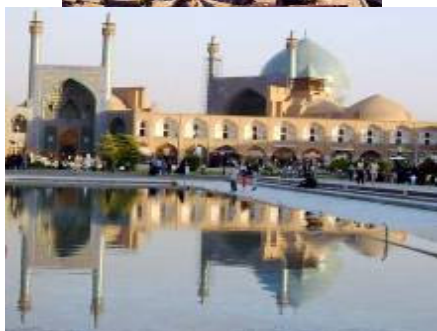
Figs 5& 6 Views of Naghsh-e-Jahan square which shows interesting design with various activities as unique example of a traditional safe and secure city. (Ref: http://www.hamshahrionline.ir/imagesupload/newspose8607bazar1-zr.jpg.jpg )

Bazaar with business activities is as an important urban heart. These activities, encourage “people use the pathways” which “Jacobs” (1961) expresses as a requirement to the defensible space. Also “Angel” in his researches mentions that crime rate is related with activity scale in streets. So, felling of ownership in Naghsh-e-Jahan among shop owners which have surrounded the spaces around would lessen social responsibility. In other words, dominant social surveillance decreases crime situation and increase environmental security. Pettersson also emphasizes on “diversity of use in quarter” in order to reducing of crimes opportunity through increasing people presence (Pettersson, 1997: 179-202) and kinds of activities.