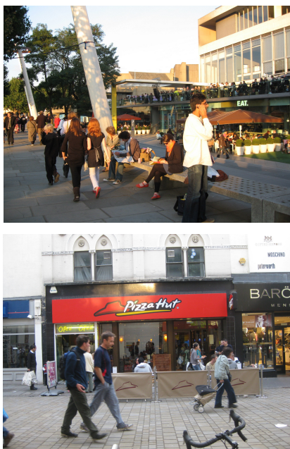
Figs 1& 2 Increasing activity rate in street and urban public spaces, with supporting social capacity concept, encouraging passengers use and reduce of crime rate sensibility. (Ref: Rezaeifar)

In fact CPTED approach, (NICP, 2005) follows specific guidelines for reducing urban crimes (Gronland, 2000), which have paid them from preventing crime center as bellow (Pourjafar et al., 2008: 78):