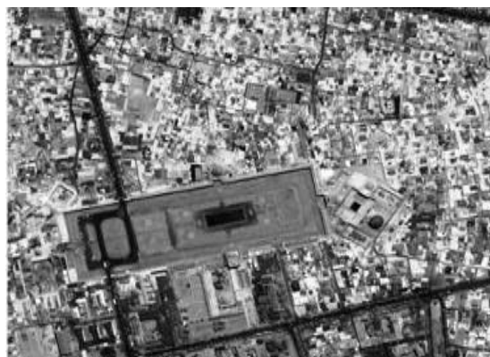
Fig 3 Naghshe-e-Jahan square, Shah Mosque plan on the right and urban texture of environs square.

The chief architect of this colossal task of urban planning was Shaykh Bahai (Baha' ad-Din al-'Amili), who focused on two key features of Shah Abbas's master plan: the Chahar Bagh avenue flanked either side by all the prominent institutions of the city, such as the residences of all foreign dignitaries and the Naqsh-e Jahan Square - "Exemplar of the World" - (Sir Roger, 1989: 172).