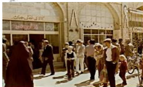
Figs 4& 5 Bazaar path and business activities beside diversity uses; recreational, religious, tourism,... around the square, give square possibility for natural surveillance and continues guarding in the old and valuable of Safavid bazaar through encouraging citizens and tourists presence. (Ref: right pic; http://tinypic.info/files/qbdokatr9ac8xh1ezxd.jpg , left pic; http://tinypic.info/files/701jxf38hqiyadw1ues.jpg )

Study on Naghshe-e-Jahan with emphasis on defensibility and environmental security of urban spaces confirm exploiting of defensible principles. One of these principles which have regarded in this historical square is diversity and efficient mix of planned uses around the square (Fig. 4, 5).