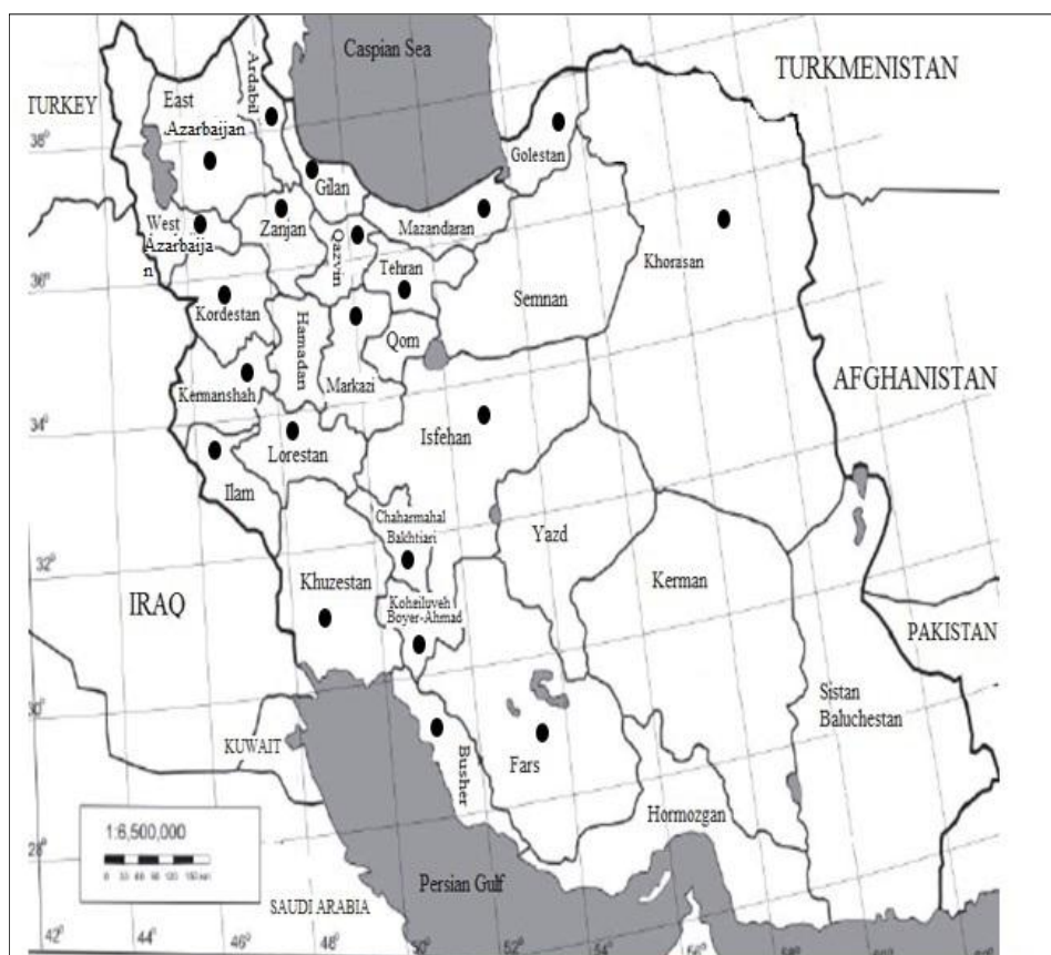
Figure 1. Geographical zones of the 180 Iranian Aegilops and Triticum accessions used in this study (black circles indicate sampling locations).

Zagros and central Elburz mountains located in a wide range from north, northwest, northeast to south and southwest of Iran (Figure 1). The evaluated accessions in this study consisted of: Six diploid- T. boeoticum Boiss. (A b genome), T. urartu Gandilyan. (A u genome), Ae. speltoides Tausch. (S genome), Ae. tauschii Coss. (D genome), Ae. caudata L. (C genome) and Ae. umbellulata Zhuk. (U genome); Five tetraploid- T. durum Def. (AB genome), Ae. neglecta L. (UM genome), Ae. cylindrica Host (DC genome) and Ae. crassa Boiss (DM genome) and Ae. triuncialis (CU genome), and One hexaploid- T. aestivum L. (ABD genome) species. All accessions were preserved in the Gene Bank of the University of Ilam. Detailed information about genome species and eco-geographical distribution of these materials is listed in supplementary Table 1.